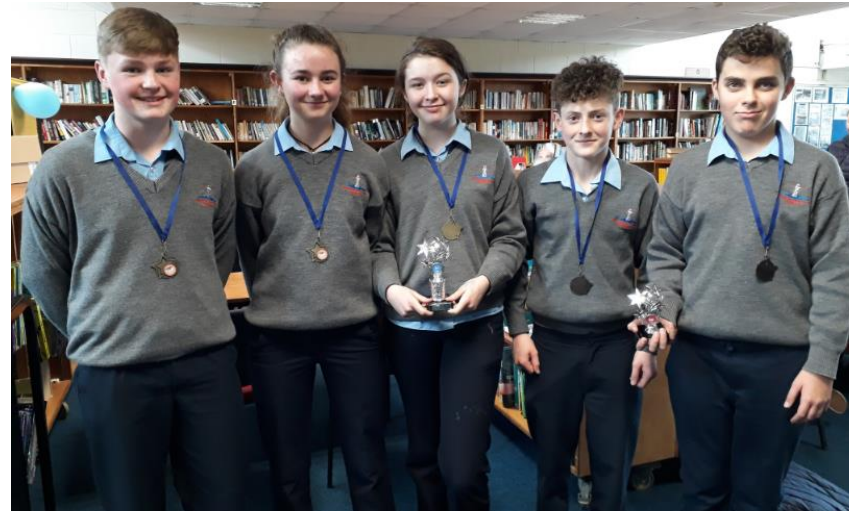
Spelling Quiz: St. Fergus